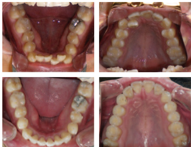
Crowding (aligners) 10.5 months